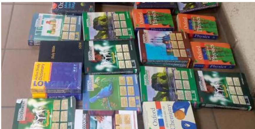
Some of the suspected pirated books confiscated by operatives of Nigerian Copyright Commission (NCC) at One Way Road, Suleja Market, Niger State.