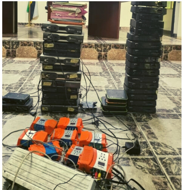
Cable satellite decoders used for broadcast piracy impounded during an anti-piracy operation carried out in Port Harcourt on 24th September, 2021.