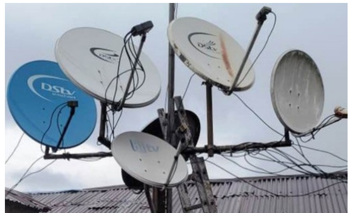
Cable satellite dishes deployed for infringing broadcast activities found during the anti-piracy operation by NCC operatives in Port Harcourt on 24th September 2021.

According to her, the anti-piracy operation was executed after investigation and surveillance activities based on a complaint lodged with the Commission by Multichoice Nigeria, owners of DSTV cable network.