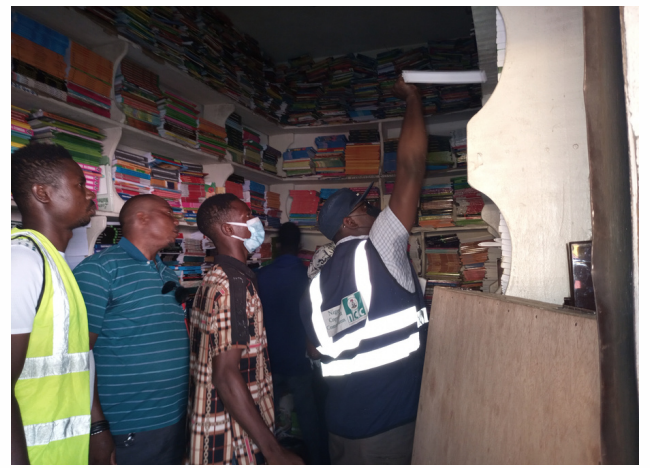
Operatives of Nigerian Copyright Commission (NCC) inspecting books at a bookshop during the raid executed at Yaba books market, Lagos on 23 September 2021.