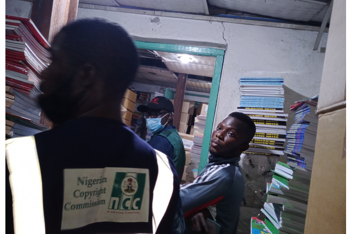
Copyright Inspectors of Nigerian Copyright Commission (NCC) inspecting some books at a bookshop during an antipiracy raid at Yaba book market Lagos.